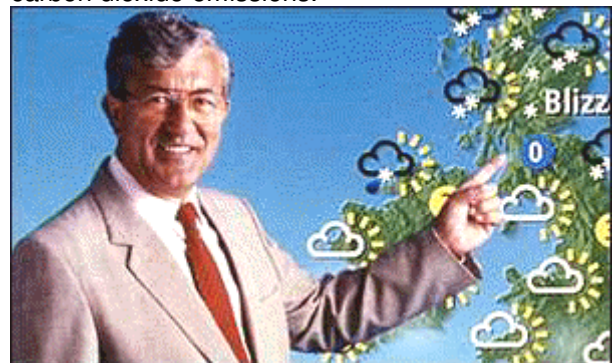
Bill Giles as many know him

Former BBC senior weatherman, Bill Giles OBE, launched the West Midlands Climate Change Pledge website at BETT 2006 in January. He explained that climate change is happening and that it will have far-reaching effects on our lives. "Average annual temperatures around the world are increasing," he said, adding, "Action is needed to reduce the negative impacts of this global warming by reducing the emission of gases that contribute to the greenhouse effect. Schools can play their part by pledging to reduce carbon dioxide emissions."