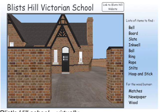
Blist's Hill school - virtually

Key Stage 1 children can explore a groundbreaking virtual reality 3D model of the Victorian classroom at the Blists Hill Victorian School site of the Ironbridge Gorge Museum.