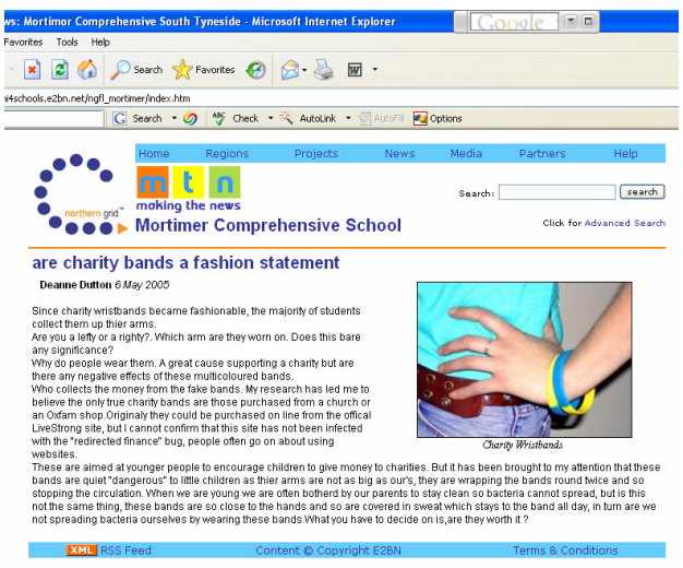
Example of a pupil's news item

The project has been extremely successful and now offers new functionality including enhanced interactive content such as Flash Meeting, an easy to use videoconferencing system, which will allow learners to set up, interview, record and publish online.