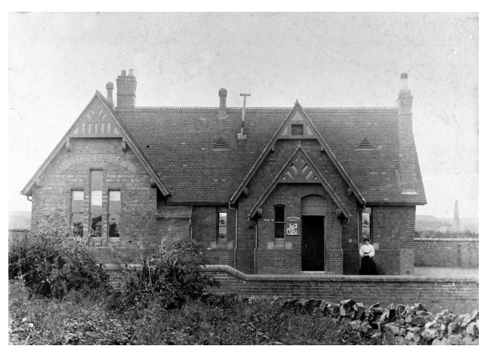
Blist's Hill school as it was